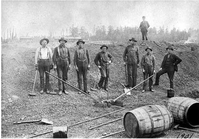
Blast hole drilling crew at the Mahoning Mine, Hibbing, 1901. Hibbing is located on the Mesabi Iron Range.**

http://www.mnopedia.org/sites/default/files/CrewMahoningMine60334.jpg