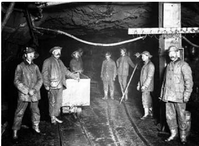
Negaunee Mine - Biwabik, MN 1920**

http://www.miningartifacts.org/Negaunee Mine - Biwabik MN 1920.gif